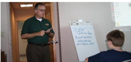
CAMPERS LEARN ABOUT space flight at the 2015 Aviation Museum of Kentucky’s Summer Aviation Camp.

This is what the Paper Airplane Competition winner receives if they win the Regional Event on November 14 th . This year’s event extends the opportunity to all the school systems that fall under the