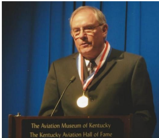
Franklin addresses the crowd after being inducted in the KY Aviation Hall of Fame.