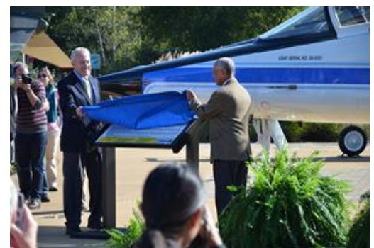
Gen. Bolden and Col. Wilcutt unveils the T-38 Talon reader board which tell about the pilot and plane.

Gen. Bolden was honored with the opportunity to dedicate the T-38 Talon in honor of Col. Terry Wilcutt. He spoke about the importance of engaging youth of our community about flying and the space program.