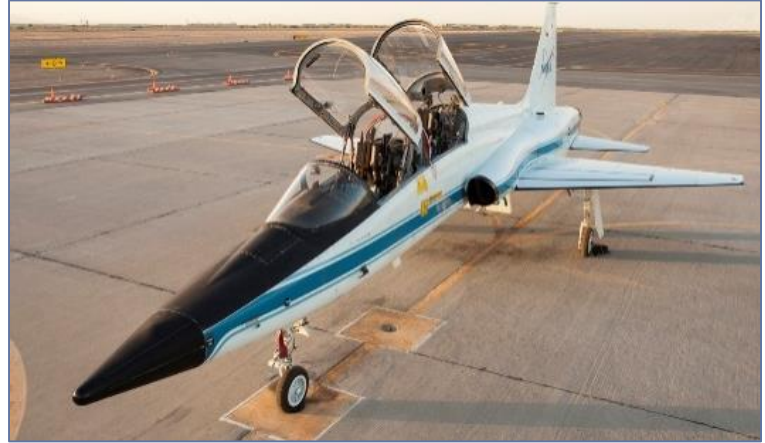
T-38 TALON #901 Ready for display at Aviation Heritage Park

Readers are encouraged to submit stories and photos. Reader feedback and comments are encouraged and welcomed. See page 4 for AHP address, phone number, etc.