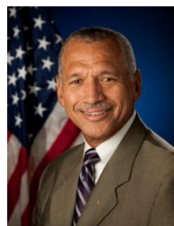
Gen. Charles Bolden